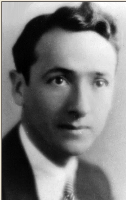
Who is this? A piece of cake for grads prior to 1990, but who among you "younger bros" knows who this is?