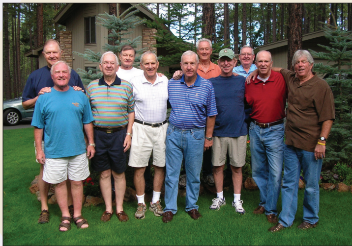
FORE! Each summer, a group of Fijis block off their calendar and gather in Pinetop to hit the links.

of our efforts include enrolling the fall pledge class in the Aristotle Program, an academic program offered by the University that targets freshmen and focuses on instilling good academic habits; and the continuation of the chapter's participation in the Faculty Fellow program.