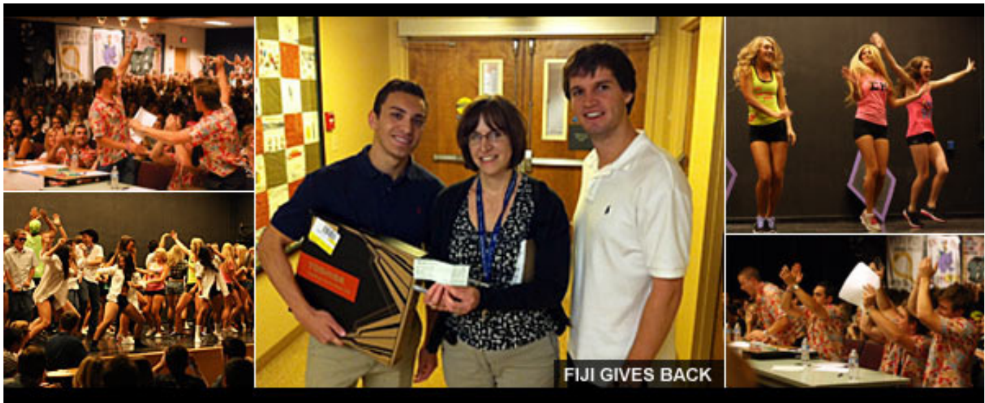
FIJI GIVES BACK

In addition to the direct grants that will be given to families, a donation was made to fund the Meal for Caregivers Program at the University of Arizona Medical Center, and a laptop computer was donated to the brave children who are fighting cancer. Often times, the only time a child can catch up with friends, family and school while in the hospital is via Skype or video chat. Until now, the Pediatric Hematology and Oncology Unit at the hospital did not have one.